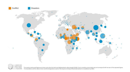
Figure 3. Populations displaced due to disasters and conflicts in 2018, IDIC.

According to the research by the International Centre for Migration Research (5), approximately 25.4 million people have been displaced each year since 2008 due to climate change or climatic events. In 2018, the number of people displaced due to conflicts or disasters reached 28 million (Figure 3).