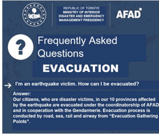
Figure 2. AFAD Evacuation Brochure (Translated), AFAD Ankara

For these population movements following the earthquake, terms such as evacuation, relocation, and migration are used in the press and in the literature. It is seen in the AFAD brochures that the earthquake victims are evacuated from the region (4), (Figure 2).